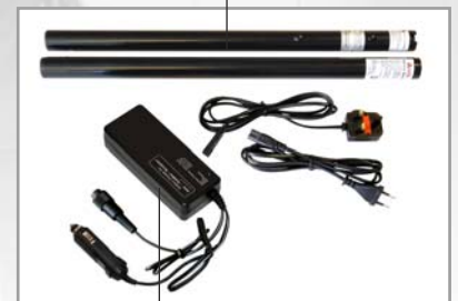
Solo 726 Fast Charger